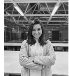
San Pedro Sula, Honduras June 30, 1998

I would love to use architecture as a tool to make a change in the world and as an instrument for personal growth. I engage well in teamwork and I like spreading optimism to the people that surround me.